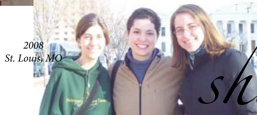
2008 St. Louis, MO