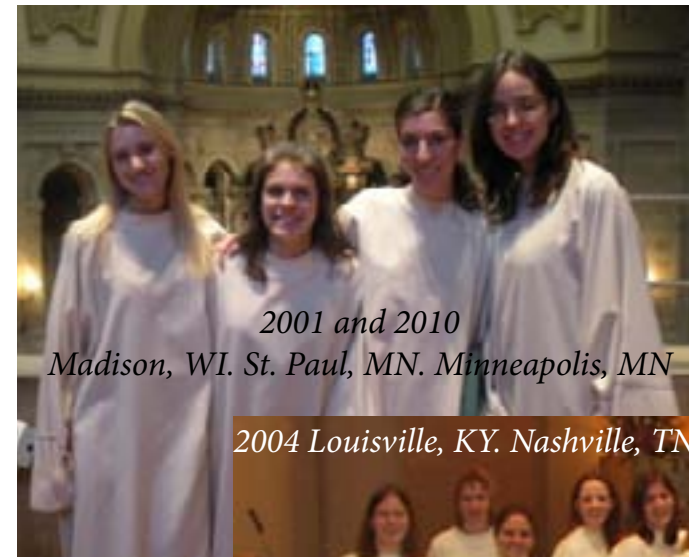
2001 and 2010 Madison, WI. St. Paul, MN. Minneapolis, MN