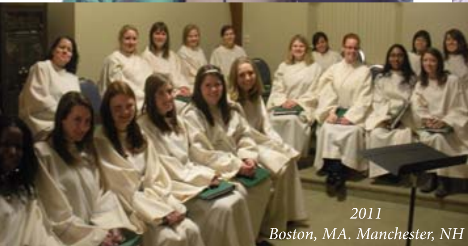
2011 Boston, MA. Manchester, NH