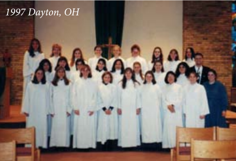
1997 Dayton, OH