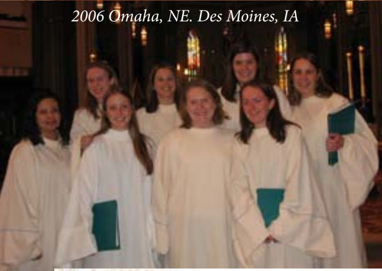
2006 Omaha, NE. Des Moines, IA