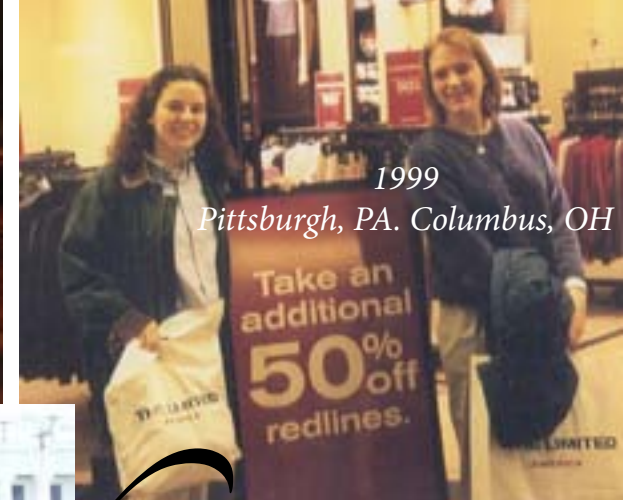
1999 Pittsburgh, PA. Columbus, OH