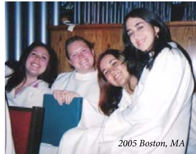
2005 Boston, MA