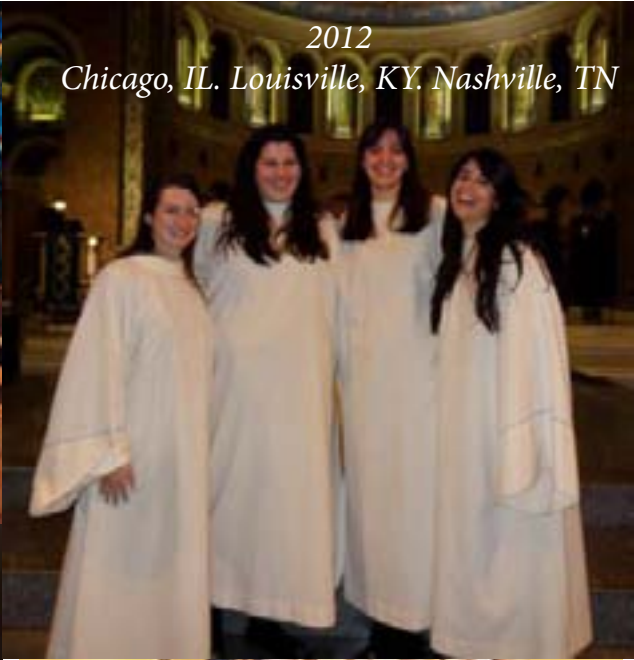
2012 Chicago, IL. Louisville, KY. Nashville, TN