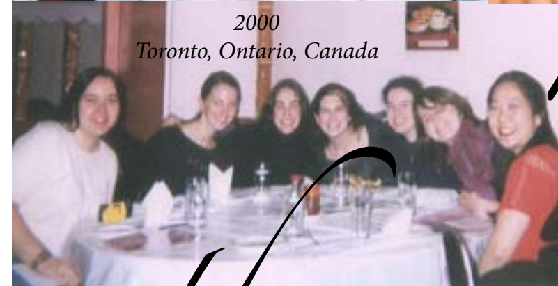
2000 Toronto, Ontario, Canada