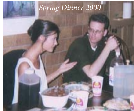
Spring Dinner 2000