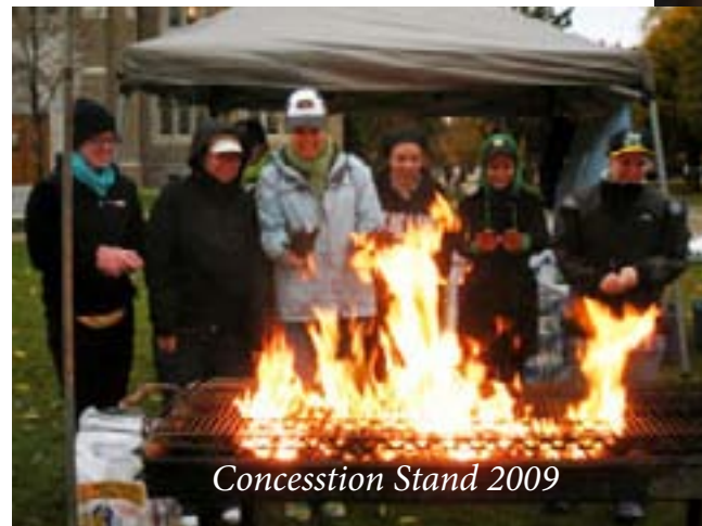
Concession Stand 2009