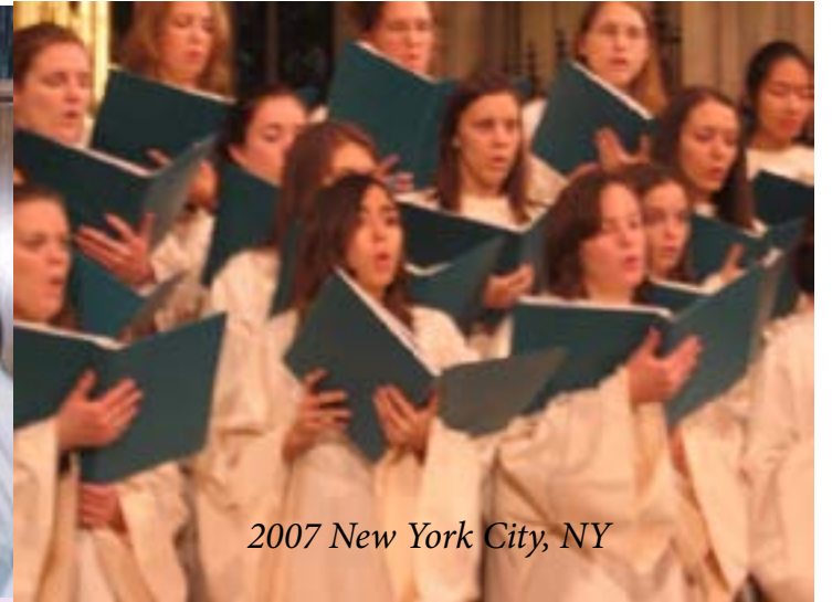
2007 New York City, NY